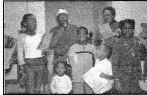
Annual Children's Christmas Party