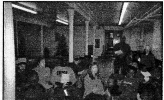
Fifth Avenue Presbyterian Church Reading Group with Gethsemane youth